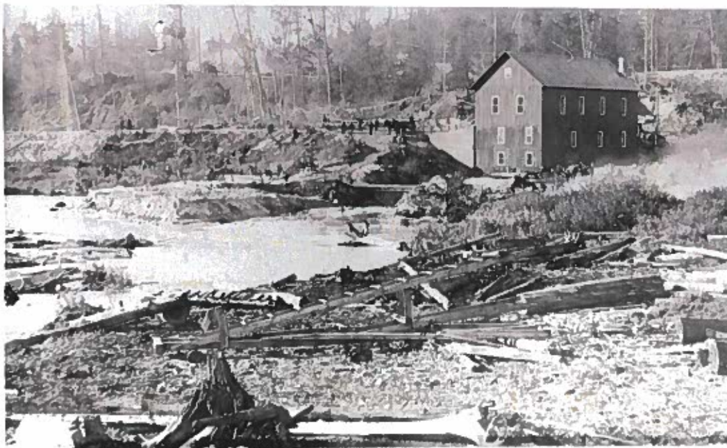
Boardman River Electric Light & Sawmill plant on Boardman River - Construction of Dam in 1894

Prior to the driving of logs down to the waiting mills, the river upstream of Boardman Lake needed to be cleared of fallen trees (a reported distance of 10 miles). Early observers reported that the stream in places “was so completely covered and hidden with a mass of fallen trees... that no water could be seen” (Leach, 1883). Eventually, and upon conversion of the saw logs into dimensional lumber or timbers, the end product that wasn’t utilized locally was sent south on schooners (and later steamships) to Chicago and points beyond.