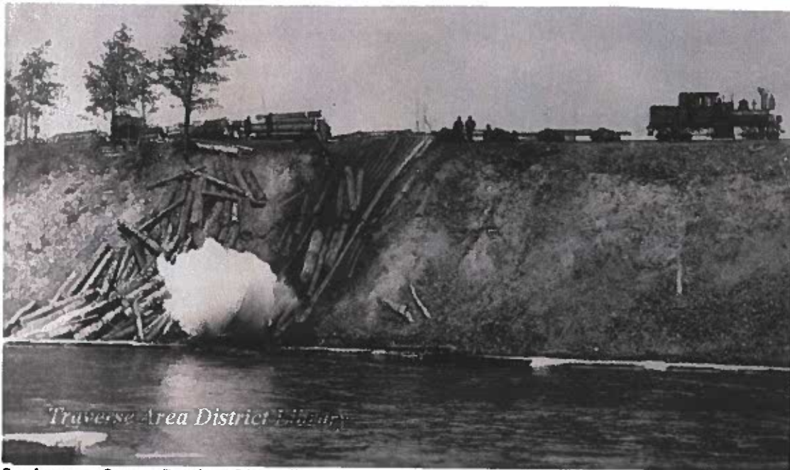
Saw logs at an Ottawa-Boardman River rollway