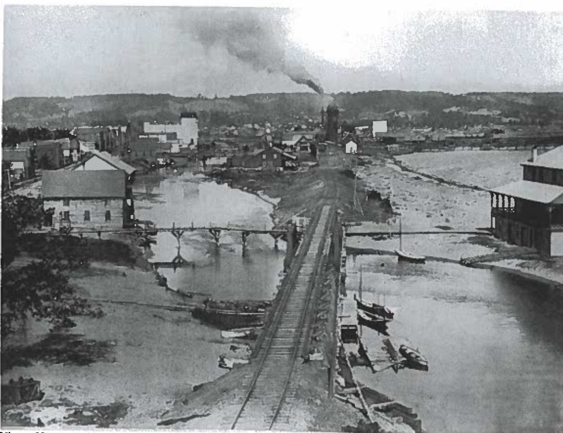
View of Traverse City and Ottawa-Boardman River Looking West