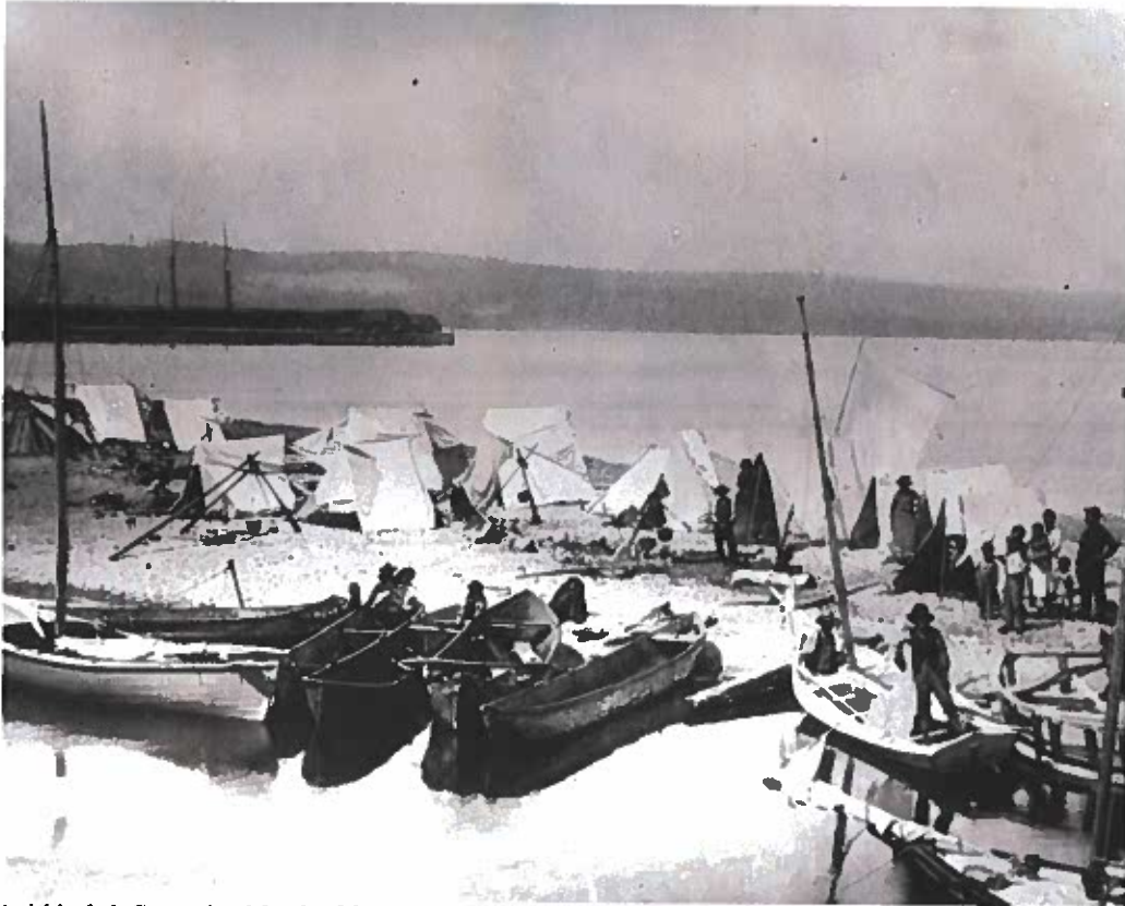
Anishinabek Camped at Mouth of Ottaway-Boardman River