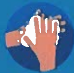
SCRUB: 20 SECONDS